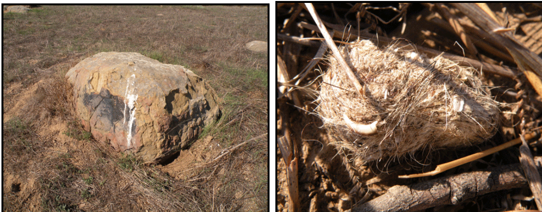
Left: white wash bird droppings on a boulder rock outcrop onsite, typical for raptors. Right: large owl pellet found below old sign post onsite, mostly likely from a Great-horned Owl.

DMEC observed raptors using the property during its cursory survey of the property in late October 2011, including American Kestrel and Barn Owl. An owl species, likely Great-horned Owl, uses the boulder rock outcrops as foraging posts and eating stations as evidenced by droppings and owl pellets, as shown on the photographs below.