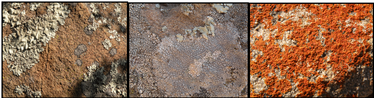
At least five different species of crustose lichens are illustrated above growing on the boulders onsite.

There is no mention of nonvascular plants, yet there are numerous species of nonvascular plants that are known from similar habitats nearby, such as the Bridle Ridge/San Marcos Foothills project site a short distance to the east. DMEC conducted a botanical survey of the Bridle Ridge project site in 1997 and 1998 (DMEC 1998 6 ) as part of an Environmental Impact Report for that project, finding 59 different species, 23 of those species were found on rock outcrops/boulders. Field surveys were conducted in multiple seasons for vascular as well as nonvascular plants. Several species of lichens on the Bridle Ridge site were considered rare and mitigation was proposed to protect them. Many of the rare lichens at the Bridle Ridge site were on boulders within grassland areas. The Park Hill Estates project site contains similar habitat and may also contain rare lichen species. Surveys of the lichen and bryophyte flora must be conducted before the inventory can be considered adequate. Below are photographs of just a few of the lichen species found onsite.