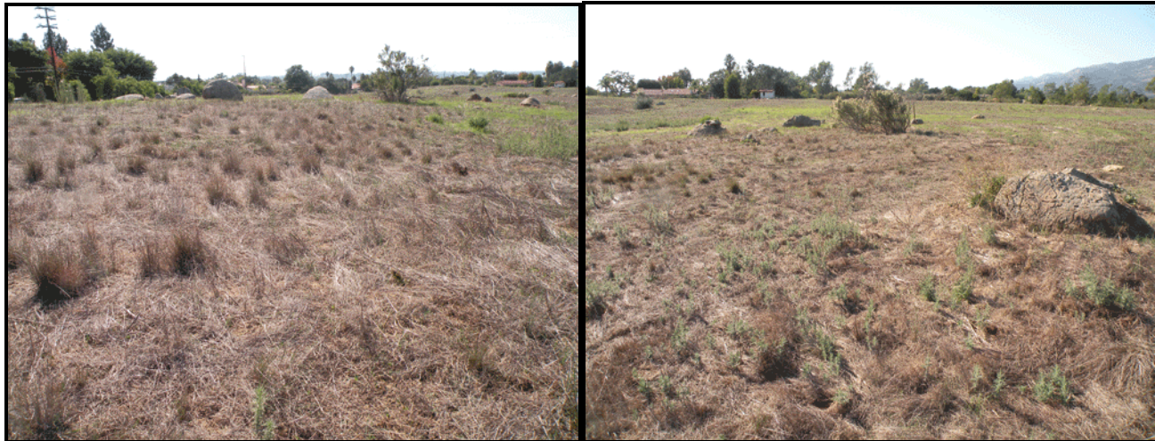
Photographs of grassland areas of Park Hill Estates site with unusually high densities of Nassella [Stipa] pulchra (Purple Needlegrass), representing Native Perennial Grassland.

The grasslands and scrub onsite grow in Milpitas stony fine sandy loam soil (MND page 6, 2 nd paragraph). The soils near Coal Oil Point on UCSB property where the proposed offsite mitigation would be contains Concepcion and Diablo soils, not Milpitas. The Milpitas soils are derived from bedrock while the Concepcion soils are derived from alluvium and have a claypan. Diablo soils are derived from residuum weathered from mudstone and/or soft shale. Neither are the same as, or similar to, Milpitas soils. Soil conditions of a mitigation site are one of the most basic considerations that must be accounted for to achieve mitigation success. Attempting to restore Milpitas sandy loam soils grasslands on other soil types is a recipe for failure. Clearly there was no attempt by those developing this mitigation measure to truly understand conditions of either site or the feasibility of the mitigation measure. It is only a plan on paper lacking substantiation on many levels.